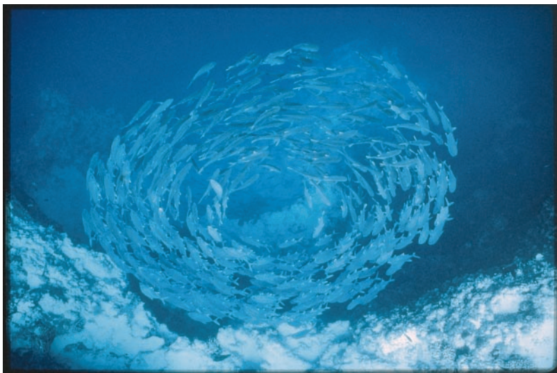
Fig. 1. Fish schools provide an example of emergent pattern such as milling in which individual members circle about an unoccupied core.

Other selection factors also favor aggregation. Mating and mate choice lead to small, ephemeral assemblages (swarms of mosquitoes, leks of sage grouse) as well as large, predictable aggregations (herds, pods, and schools migrating to and from spawning