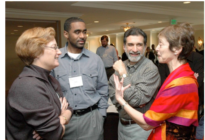
Peer Exchange – Network meeting