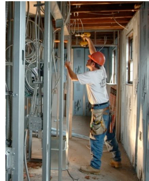
ACTION Housing - Pittsburgh