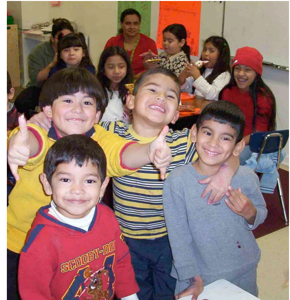
AHC After School Program - VA